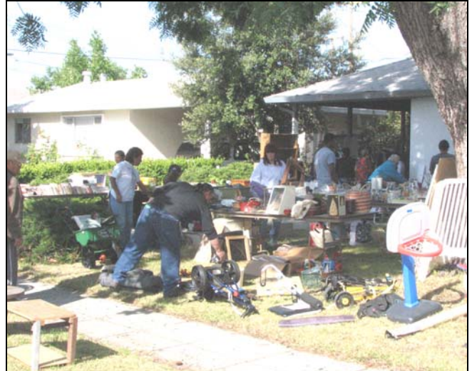
Bargains galore at the SNAIL Yard Sale, June 9th.

All SNAIL area homeowners, residents and guests are invited. Children are welcome.