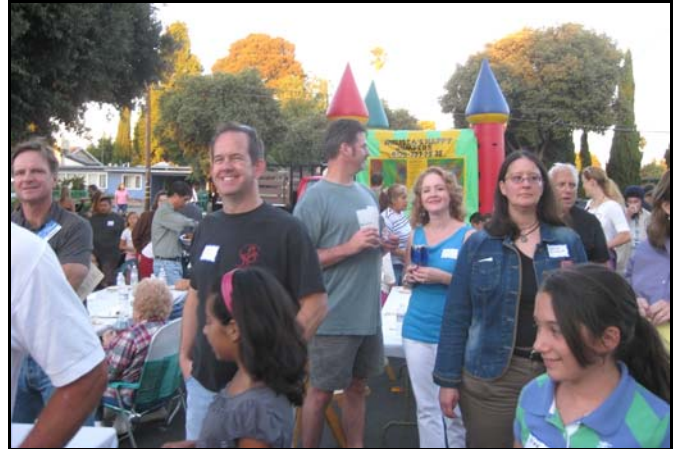
The crowd at National Night Out, 4 August 2009.

All SNAIL area homeowners, residents and guests are invited. Children are welcome.