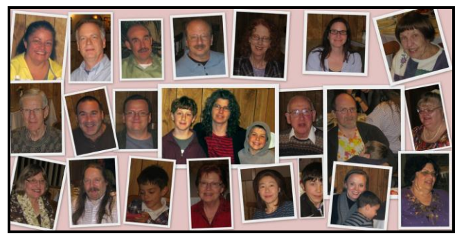
SNAILs enjoying the annual Chinese New Year Dinner, Shanghai Restaurant, Feb. 27