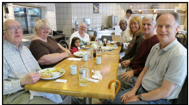
SNAIL Dinner Nite Out on June 4th at Gombei Bento