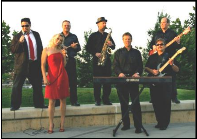
Dance to The Sound Effect at NNO!

Our favorite annual block party, SNAIL's National Night Out, will be back on Tuesday August 7, 6:30 pm to 9:00 pm. Same location as last year: E Arbor Ave at Morse Ave. Free BBQ hot dogs and sausages, live entertainment, jump house, and fire engines! Come meet neighbors and our city safety officers!