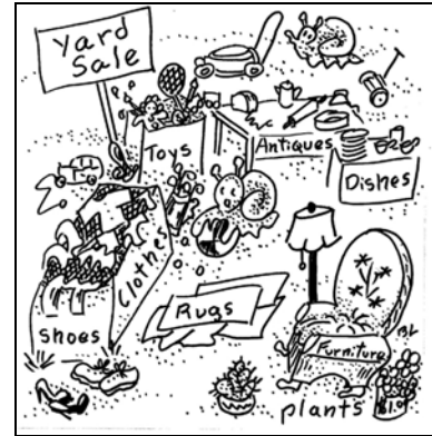
Donate/purchase at our annual yard sale on June 11-12!

We would appreciate more volunteers to help on Saturday 8 - 12 or 12 - 4pm Sunday 9 - 12 or 12 - 3pm Call Connie