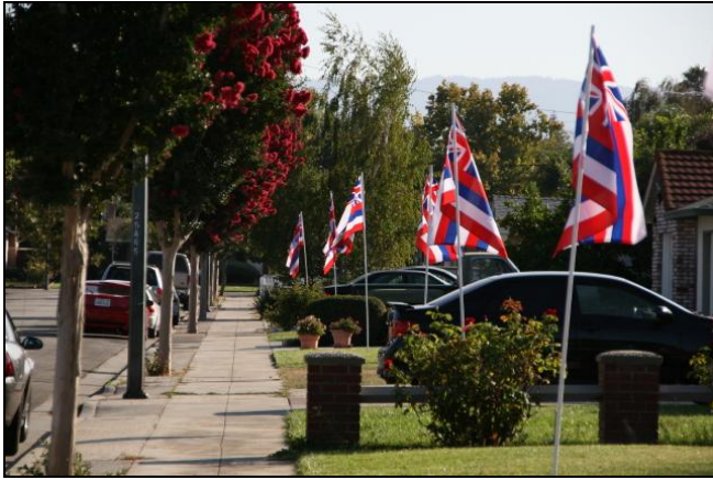
Hawaiian Flags lining the 600 block of Manzanita

You might be asking, why were there Hawaiian Flags all the way down the 600 block of Manzanita Ave from September 29th through October 2nd?