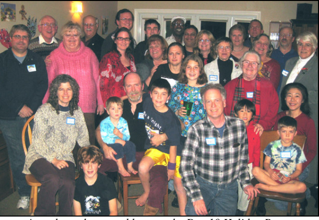
Attendees who stayed later at the Dec 10 Holiday Party.