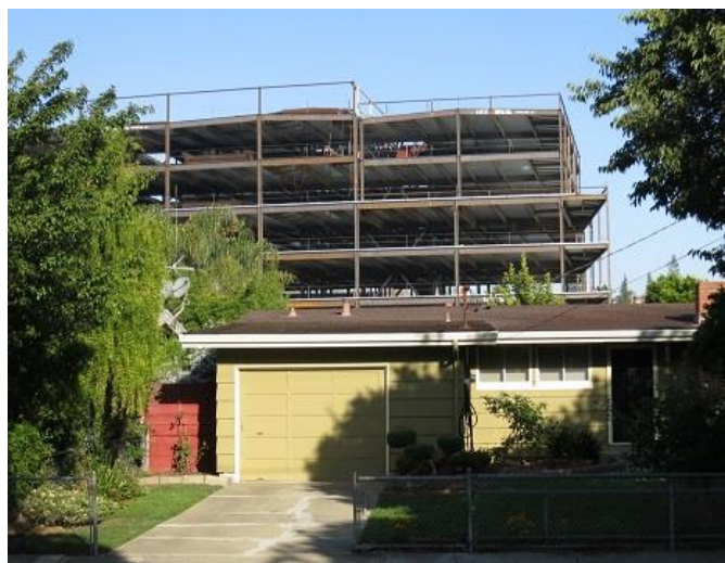
LinkedIn building construction as seen from Pine Ave.