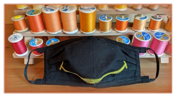
SMILING EYES - Patricia's Reflections

Over the past twenty-six months many of us have had the opportunity to develop a new ability: the ability to have our eyes smile while our nose, mouth, and chin are covered. Some people have always had this ability, a complement to their broad, visible smiles. Of course, taking off those masks and sharing a smiling face in its entirety is something to celebrate. As we've begun to spend time without face masks, I'm celebrating the return of toothy grins and dimpled smiles.